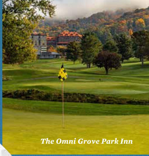
The Omni Grove Park Inn