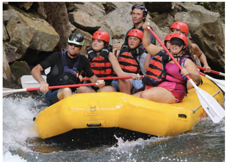
SEE Adventure Camp participants whitewater rafting in Western North Carolina.