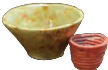
Pottery bowls made by SEE students at Tracy's Little Red Schoolhouse in Winston-Salem.