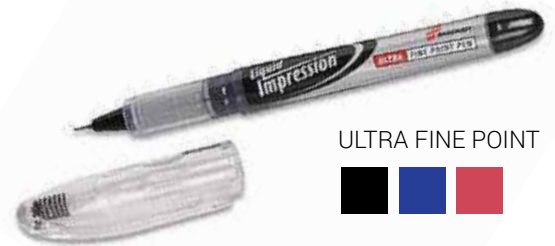
ULTRA FINE POINT