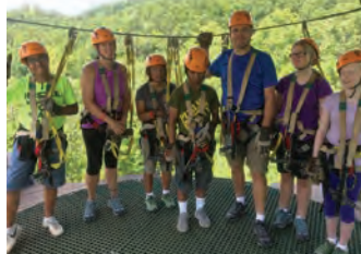
Student Enrichment Experience (SEE)