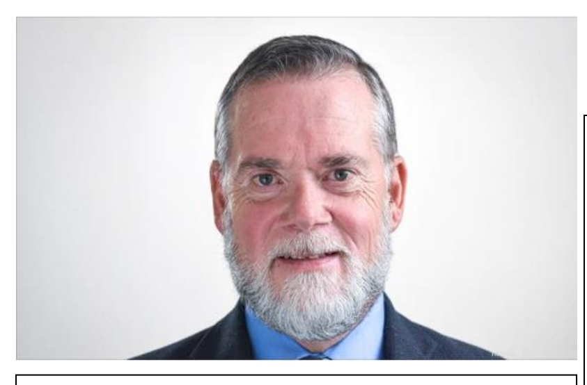
IFB Solutions Employees and Families,

As we head into the holidays, I want to thank you for your commitment to IFB Solutions and our mission. 2021 was filled with challenges, but once again, the IFB family pulled through as a team. I look forward to great things happening in 2022. I hope you and your families are blessed with a Merry Christmas and healthy holiday season.